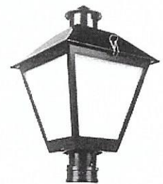
The new pedestrian scale light fixtures will contribute to the beautification of the neighborhood.

The second project will contribute to the beautification of the neighborhood by adding pedestrian scale lighting along the entire length of the sidewalk on Glenridge Drive from Glenlake Parkway to Spalding Drive. The pedestrian scale lights (pictured to the right) are LED illuminated and mounted on the inside of the sidewalk on 16-foot poles.